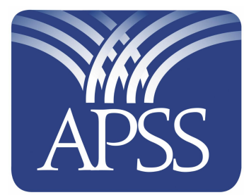
Association of Publishers for Special Sales

Also, register for these 2023 Book fairs scheduled to take place physically (http://tinyurl.com/y7bpzgld)